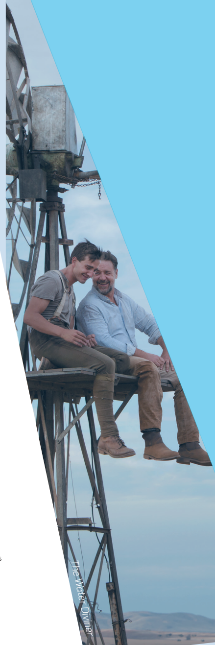
The Water Diviner