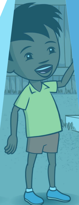
Little J & Big Cuz