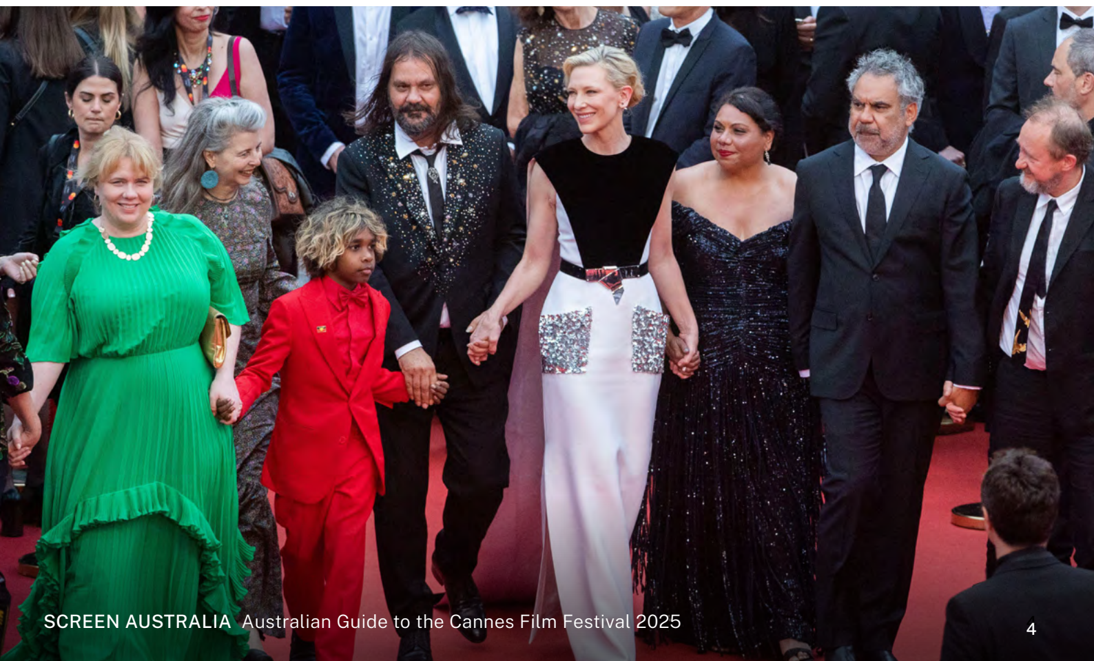
The New Boy - Official Selection - Un Certain Regard 2023

Independent from the Festival de Cannes and organised by the French Union of Film Critics, this sidebar has a tradition of discovering new talents from all over the world. Read more here .