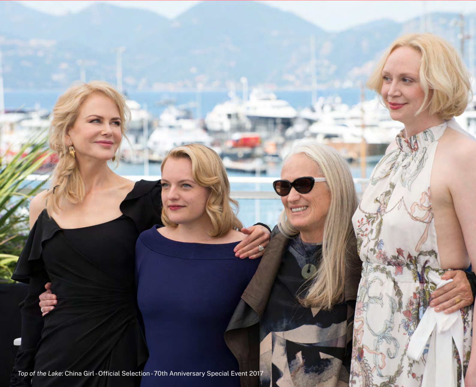
Top of the Lake: China Girl - Official Selection - 70th Anniversary Special Event 2017

The Cannes Film Festival is the biggest and most important celebration of cinema on the annual festival calendar and a unique opportunity to build a network of international film industry professionals.