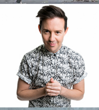
LET'S BREAK EM UP

Synopsis Aiready world-weary in their early twenties, Pippa and Helena are a couple of young people struggling not to constantly embarrass themselves. Based on the experiences of its two stars and creators, Leftovers finds the satirical in the mundane lives of young people.