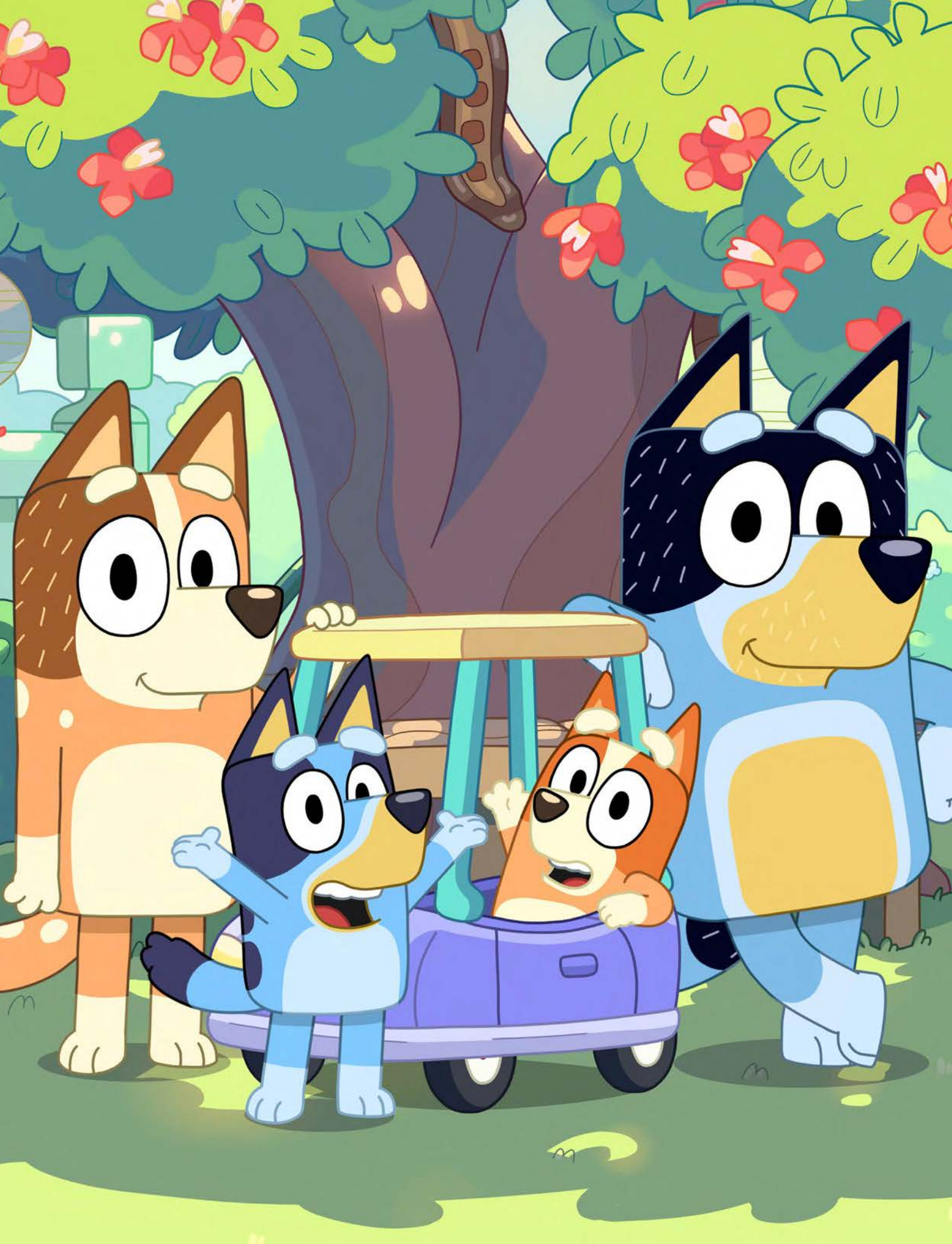
Bluey series 2