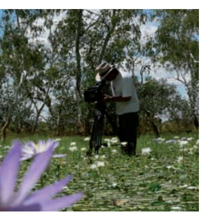
Allan Collins filming Willaberta Jack

Wirriva: Small Bov