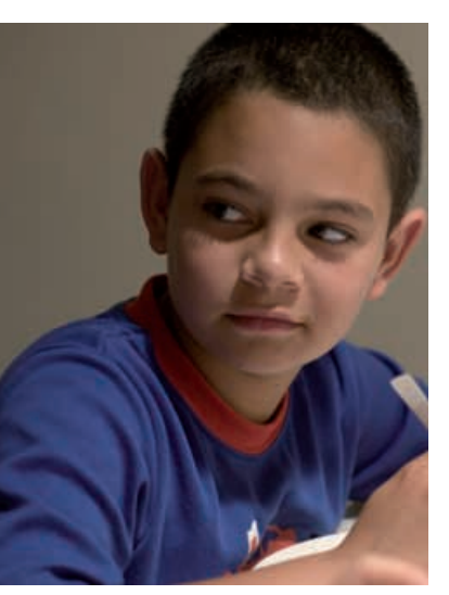
Too Late