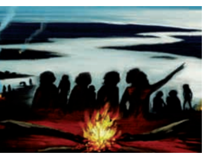
Karla: Fire Story