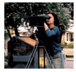
Black Chicks Talking Writer/director: Leah Purcell

Key steps along the way are set out in the chronology starting on page 5.