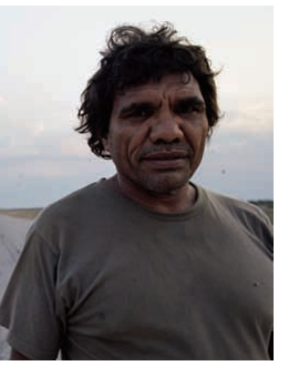
Yellow Fella