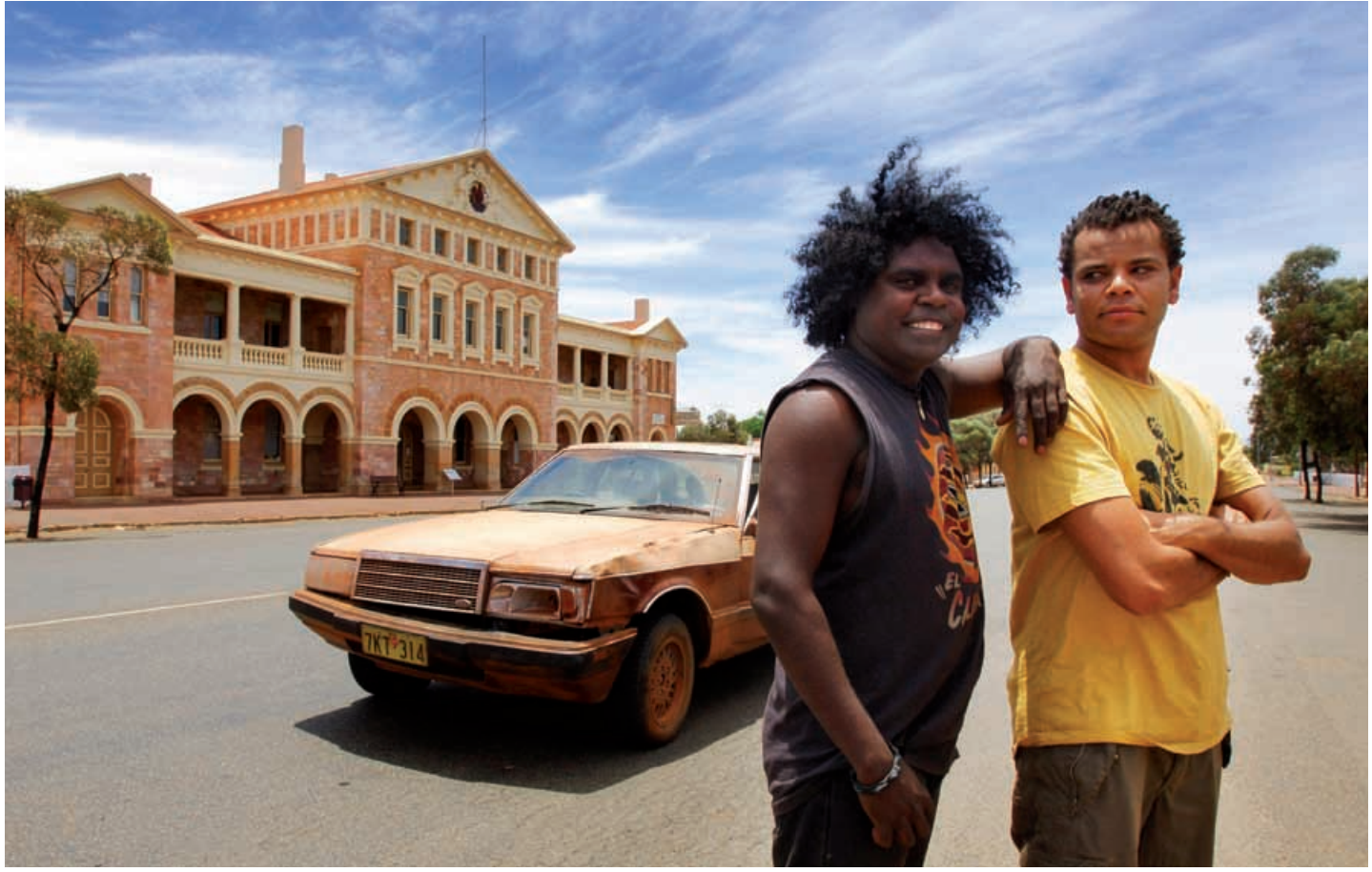
Stone Bros