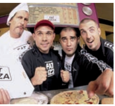
Fat Pizza