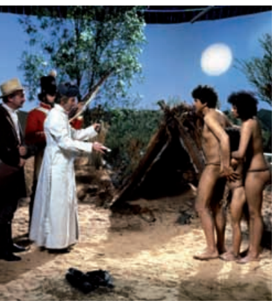
The Cake Man

Double Trouble