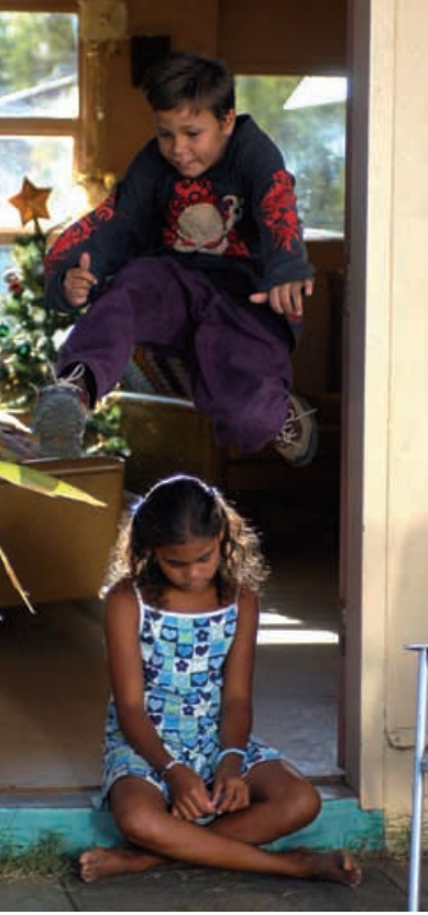
Queen of Hearts