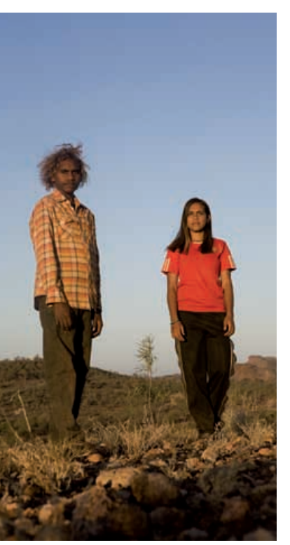
Samson & Delilah