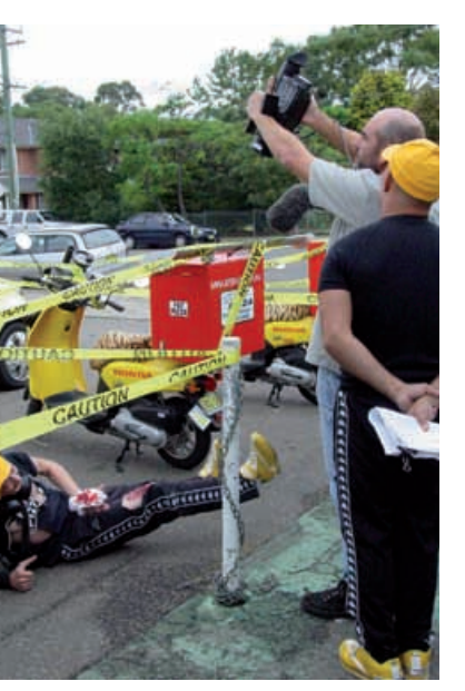
Behind the scenes of Pizza

Indigenous Australians in key creative roles (producer, director, writer or DOP) are credited in italics.