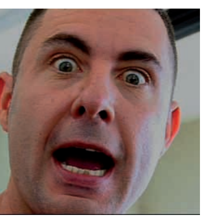
Who Are You?