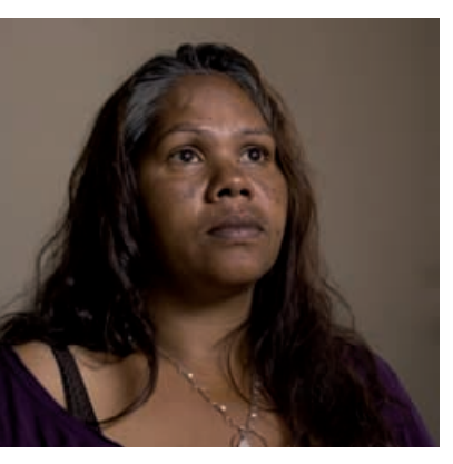
When the Natives Get Restless