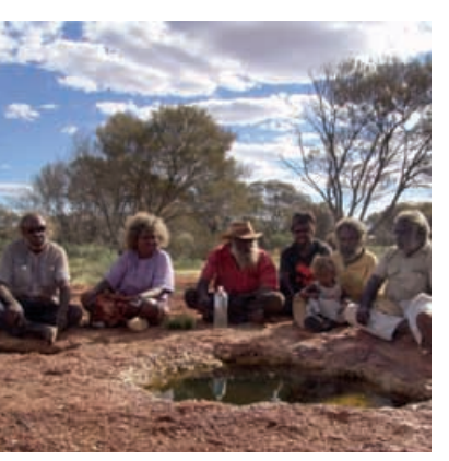
Footprints in the Sand: The Last of the Nomads